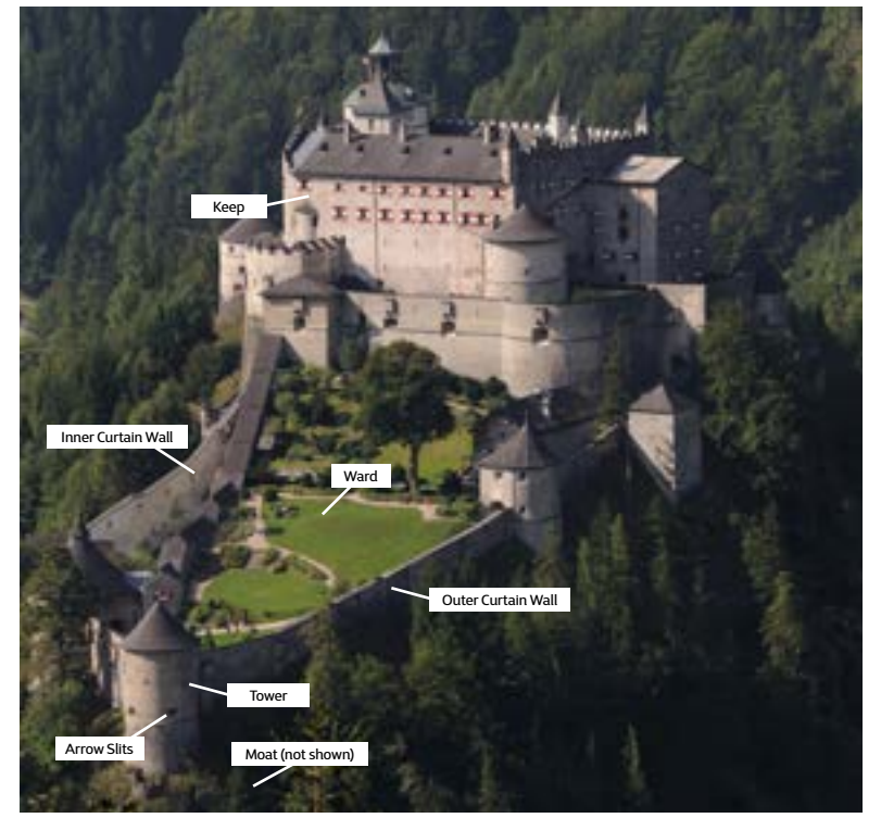
Castle of Hohenwerfen, Austria